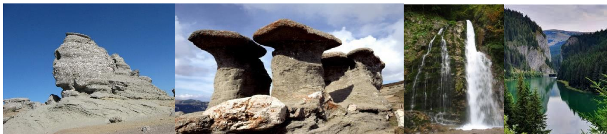
The Sphinx of Bucegi, The Old Women (Babele), The Howling Waterfall, Scropoasa Lake with Orza Gorge

07:00 AM: Departure from Bucharest, heading towards the Prahova Valley, the most developed and famous tourist area in the Carpathian Mountains, specifically the Bucegi Mountains. The Bucegi Mountains are recognized as a natural park to protect large mammals (bears, wolves, lynx, deer, chamois, etc.) and rare flora (edelweiss - Leontopodium alpinum Cass, lady's slipper – Cypripedium calceolus , etc.), along with ancient forests. The geological structure with a combination of crystalline schists, sandstones, and limestones allows for the formation of spectacular landforms such as concretions, gorges, caves, waterfalls, lakes, etc.