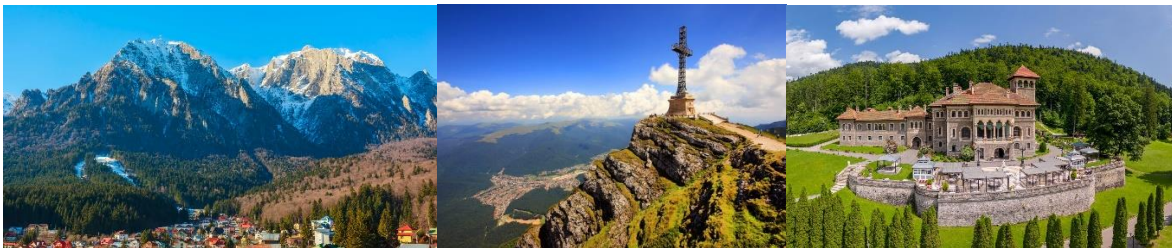
Bușteni, the Cross on Caraiman dedicated to the heroes of World War I, Cantacuzino Castle

11:30 AM – 12:30 PM: Travel to Râșnov. The journey will pass through Bușteni and Azuga resorts, on the outskirts of the Bucegi Natural Park, some of the most popular mountain resorts, offering spectacular views and a wealth of vacation opportunities, from skiing to mountain excursions. Râșnov, located on the commercial route that crosses the Carpathian chain from Wallachia to Transylvania, was initially a Dacian-Roman fortress named Cumidava, then a peasant fortress was built, which still stands today and is an important tourist attraction (which will not be visited during this excursion).