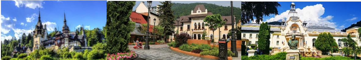
Peleş Castle, Sinaia Town Hall, Sinaia Casino

Peleş Castle is located in the resort town of Sinaia, the former summer residence of the Romanian Royal Family, and currently houses the Peleş National Museum.