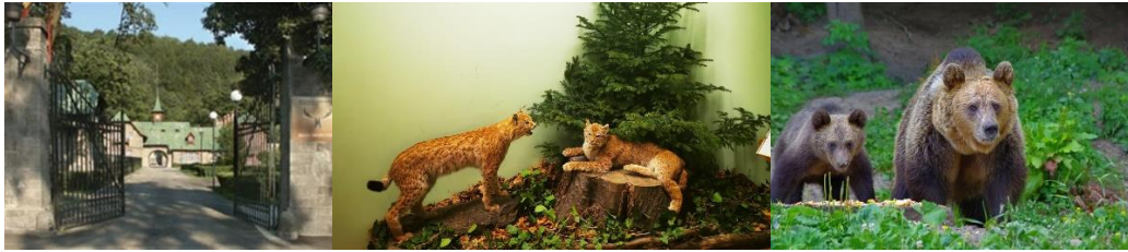
Posada – the hunting museum

09:00 AM: Visit to the Posada Hunting Museum – 30 minutes visit.